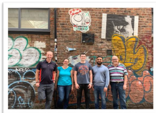
£5,000 Donation to Wood Street Mission and staff volunteering at Centre Point