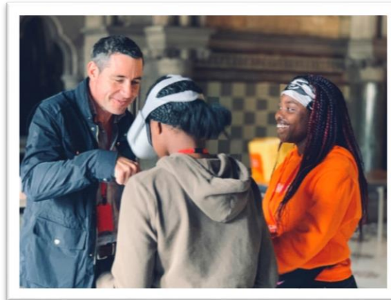
Students participating in OTH's Work Experience Week