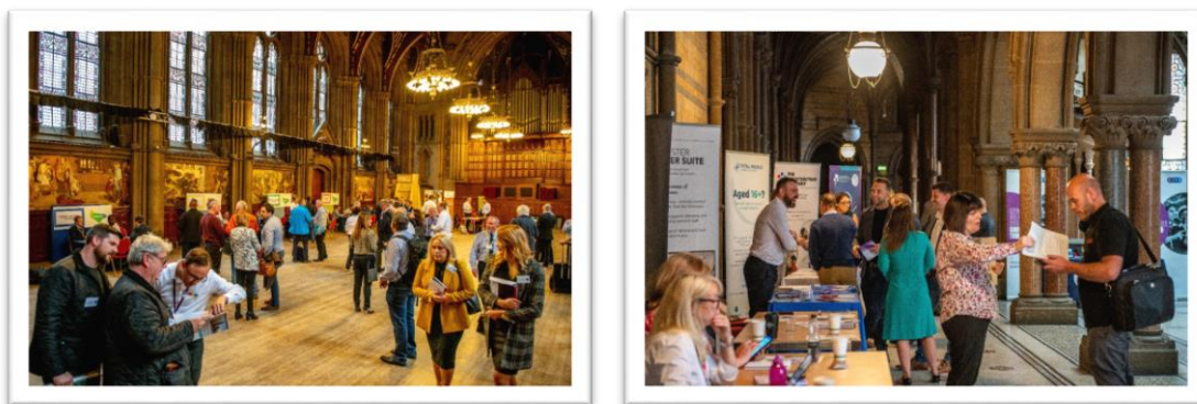
Photographs from the April 2019 Meet the Buyer Event