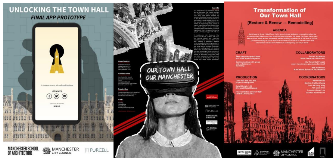
Selection of posters created by student project groups